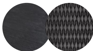
HFTS 1B01 teak scuro anthracite