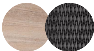
HFTK 1B01 teak natural anthracite