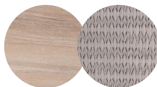
HFTK 1B02 teak natural pepper