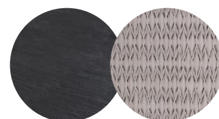
HFTS 1B02 teak scuro pepper